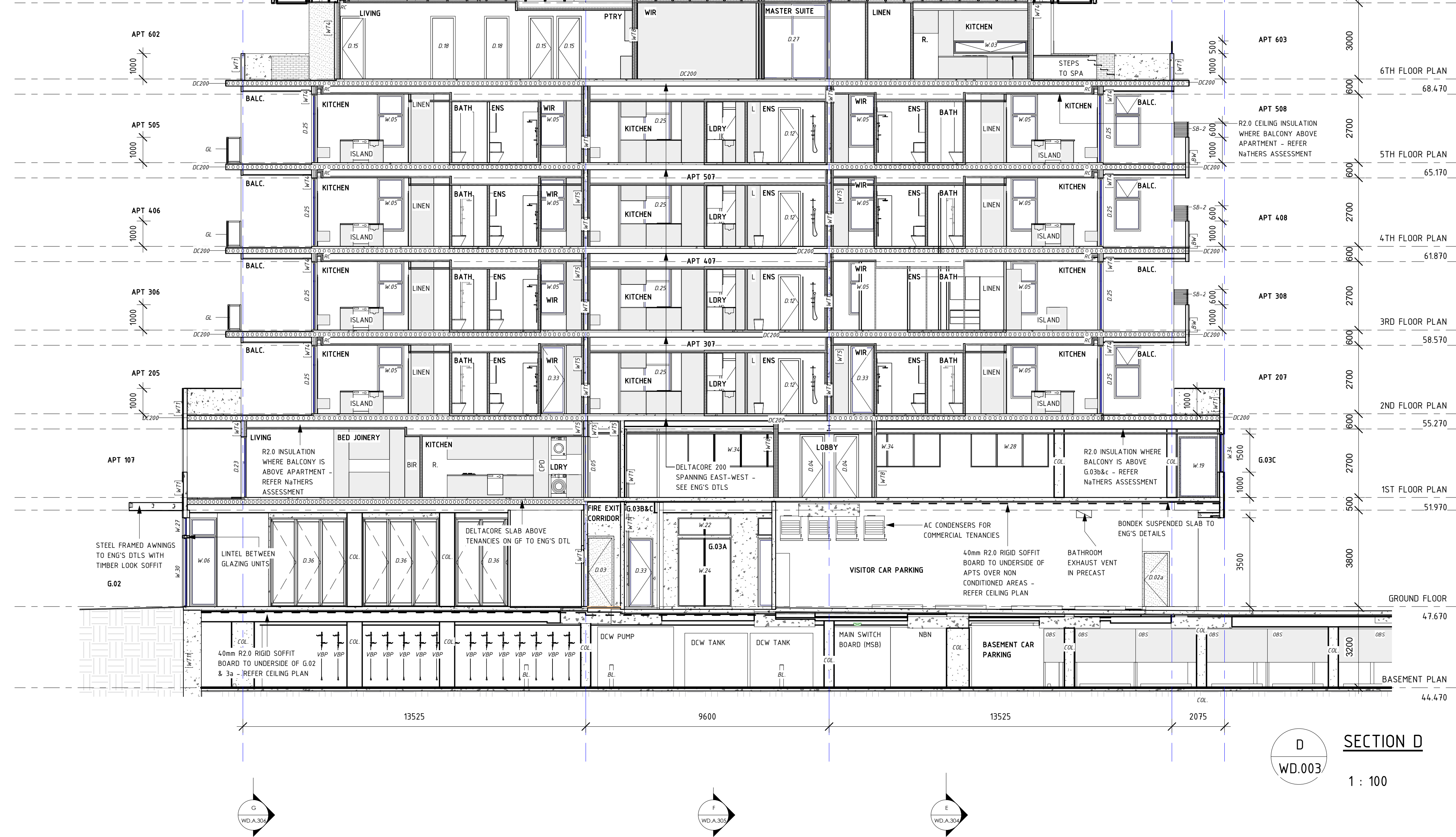
SECTION D 1 : 100

REFER ACOUSTIC ASSESSMENT FOR FLOOR INSULATION REQUIREMENTS. REFER NATHERS & SECTION J REPORTS, AND SEE CEILING PLANS, FOR THERMAL FLOOR INSULATION REQUIREMENTS.